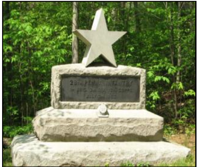
One of two monuments in Gettysburg honoring the 28th Pennsylvania Infantry fighting on Culp's Hill